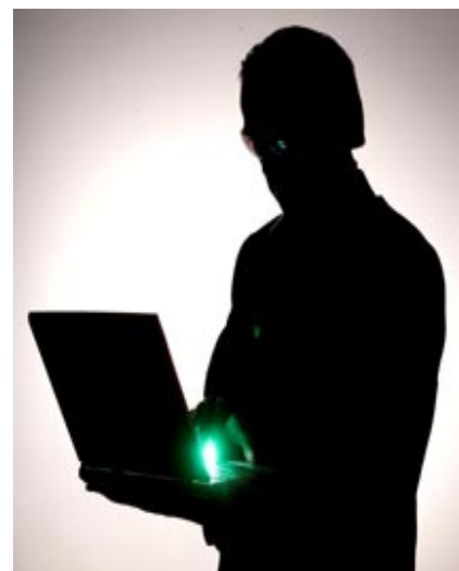
JANUS can recover what others have attempted to hide.

JANUS experts utilize proprietary tools to attempt to recover data that you need. In most cases we can reconstruct damaged, deleted, reformatted, and erased files and directories. JANUS' techniques can also usually recover password protected or encrypted data. This process is typically undertaken in a JANUS laboratory where our staff works with tools and techniques to carefully recover all the information that exists.