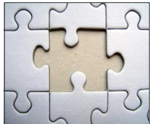
JANUS can help you fill in the missing pieces.

JANUS Associates, Inc. is a certified Woman Owned Small Business and an Equal Opportunity Employer. We believe in giving back to our community and many of our employees volunteer their time to not-for-profit organizations.