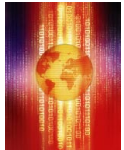
Electronic Discovery Are you ready for the new challenges?

JANUS tailors solutions to fit the individual situation. We understand that a cookie cutter approach can create problems by missing critical information. We offer plaintiffs' and defendant's litigation support, forensics, eDiscovery services and business consulting designed to minimize your risk, maximize your return on investment and help you prevail.